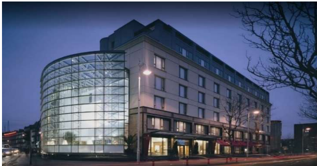
THE GREEN - DUBLIN

The Green is ideally placed in the heart of Dublin City Centre, adjacent to St Stephen's Green and less than five minutes' walk from Grafton Street, Dublin's premier shopping district. The area around St Stephen's Green is probably the most picturesque part of the city, as much of the Georgian architecture has been preserved.