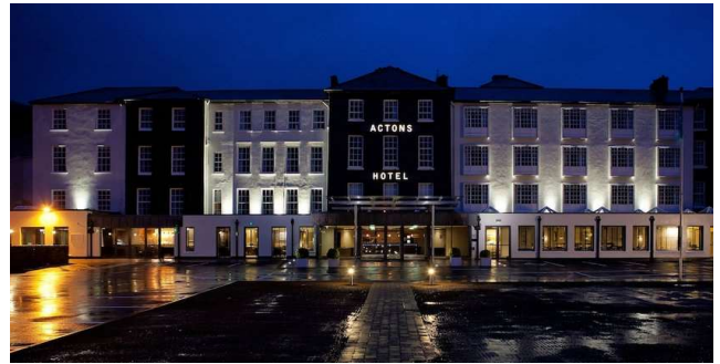
ACTONS HOTEL - KINSALE

Actons of Kinsale is situated in the heart of the colourful historic harbour town of Kinsale also referred to as the Gourmet Capital of Ireland. Actons is the oldest hotel in Kinsale.