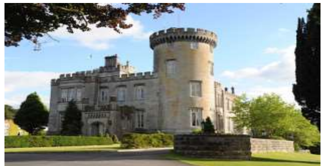
DROMOLAND CASTLE - NEWMARKET ON FERGUS

Ireland's most magical address, Dromoland Castle, has been welcoming guests since the 16th century. The 5-star ancestral home of the O'Brien's of Dromoland.