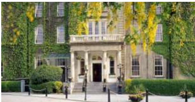
KILLARNEY GREAT SOUTHERN HOTEL - KILLARNEY

This hotel stands proudly as Killarney's Premier Historic Hotel. Surrounded by 6 acres of beautiful gardens right in the centre of bustling Killarney town, within a moment's walking distance of the sublime Killarney National Park.